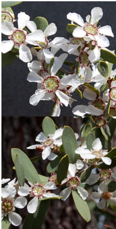
Coastal tea-tree Leptospermum laevigatum